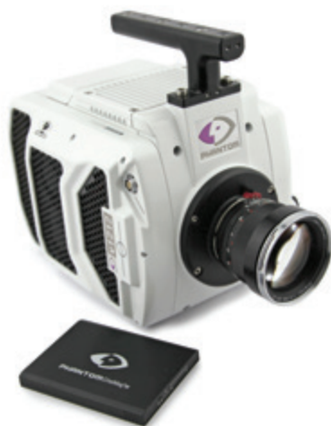
Phantom v1212 with CineMag®