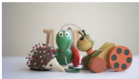
E.I. 40,000 applied