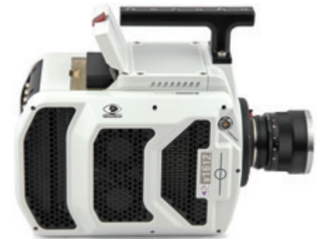
v1612 with 2TB CineMag

Phantom® v2512 Phantom® v2012 Phantom® v1612 Phantom® v1212